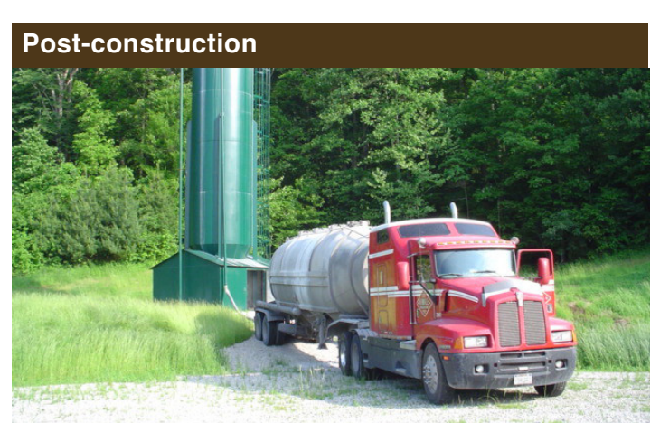
Carbondale II Project Doser