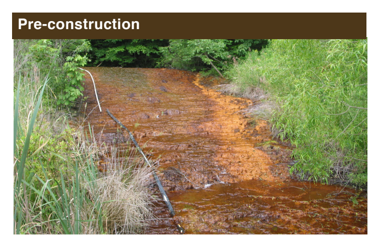
Carbondale East Seep

Project Status: Complete: 2004 ODNR Project Number: AT-WI-05