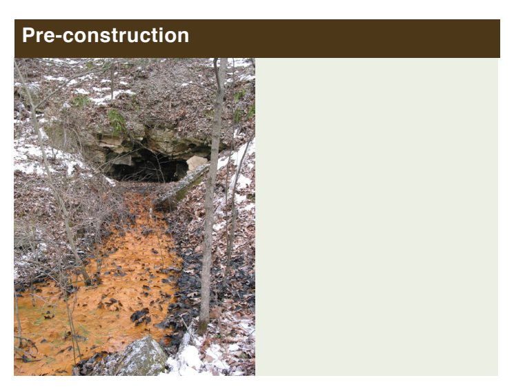
Underground mine entrance

Project Status: Complete: 8/30/2004 ODNR Project Number: JK-MI-51