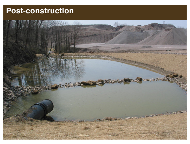
Jaymar Steel Slag Leach Bed