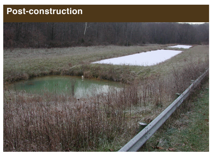
Successive Alkaline Producing System (SAPS)

Buckeye Furnace and Buffer Run Project is located in Section 25 of Milton Township in Jackson County and lies within the 12-digit HUC unit #050901010403. The site is 65 acres and is located in the Little Raccoon Creek subwatershed. Deep mining of the area resulted in continuous AMD discharge from underground mines to Buffer Run, a tributary to Little Raccoon Creek. This area was also strip mined and used for a wash plant facility for a deep mine operation, resulting is several unreclaimed coal refuse areas and slurry ponds draining to Buffer Run. The design was completed by BBC&M Engineering Inc. for $125,000. The treatment approach for this site was to eliminate strip pits, reclaim the gob pile, and install a Successive Alkaline Producing System (SAPS) a passive treatment system. The major considerations for this project was mostly source control and but also constructing a passive treatment system. The goal of the design was to reduce 75 percent of the acidity discharging into Little Raccoon Creek. Construction was complete June 20, 1998, by Earth Tech Inc. for a cost of $1,090,530. The funding source for the project design was ODNR-DMRM, and for construction the sources were ODNR-DMRM, OEPA and OSM. Pre-treatment acid and metal loadings at site BR0010 are shown in figure 1.