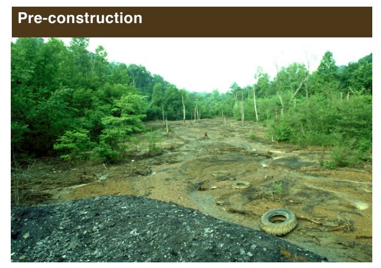
Mine waste in valley, Photo by Raccoon Creek Partnership

Project Status: Complete: 6/20/1999 ODNR Project Number: Jk-MI-18