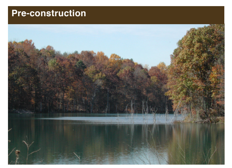
Lake Milton - 25 acre acidic lake, Photo by Ben McCament

Project Status: Complete: 9/5/2006 ODNR Project Number: Jk-MI-113