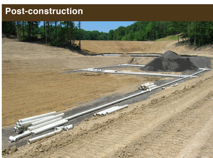
Steel slag bed downstream Lake Milton