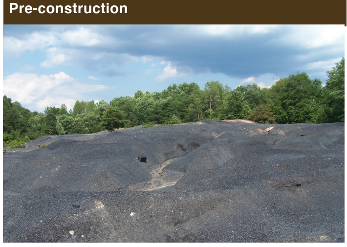
Gob Pile with erosional gullies

Orland Gob Pile project is located in Section 2 of Swan Township in Vinton County and lies within the 12 digit HUC unit #050901010202. The Orland Gob Pile project discharge, site WB050, is located on an unnamed tributary that drains to the West Branch of Raccoon Creek at river mile 2.0 (figure 2). The project consists of approximately a six acre refuse (gob) pile. The exposed gob pile generates acid mine drainage and erodes coal fines into the West Branch of Raccoon Creek. The treatment approach for this site consists of incorporating lime into the gob and re-soil material, grading the gob pile to obtain positive drainage, covering the gob with suitable re-soil material, installing a limestone diversion channels (975 linear feet) around the site and establishing vegetation. The goal of the design is to reduce approximately 60 lbs/day of acid loads and 14 lbs/day of metal loads from entering the West Branch of Raccoon Creek. The design was completed by ODNR-DMRM in-house, $34,940. Construction was completed by Seifert Construction for $197,535. Funding source for the project design and construction is ODNR-DMRM and OSM. Pre-treatment acid and metal loadings at site WB050 are shown in Figure 1.