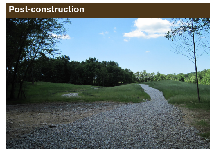
Re-graded and re-vegetated hillside where Orland Gob Pile previously stood.

Orland Gob Pile project is located in Section 2 of Swan Township in Vinton County and lies within the 12 digit HUC unit #050901010202. The Orland Gob Pile project discharge, site WB050, is located on an unnamed tributary that drains to the West Branch of Raccoon Creek at river mile 2.0 (figure 2). The project consists of approximately a six acre refuse (gob) pile. The exposed gob pile generates acid mine drainage and erodes coal fines into the West Branch of Raccoon Creek. The treatment approach for this site consists of incorporating lime into the gob and re-soil material, grading the gob pile to obtain positive drainage, covering the gob with suitable re-soil material, installing a limestone diversion channels (975 linear feet) around the site and establishing vegetation. The goal of the design is to reduce approximately 60 lbs/day of acid loads and 14 lbs/day of metal loads from entering the West Branch of Raccoon Creek. The design was completed by ODNR-DMRM in-house, $34,940. Construction was completed by Seifert Construction for $197,535. Funding source for the project design and construction is ODNR-DMRM and OSM. Pre-treatment acid and metal loadings at site WB050 are shown in Figure 1.