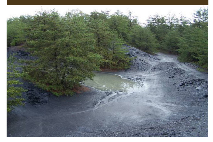
Gob and spoil pile with standing water