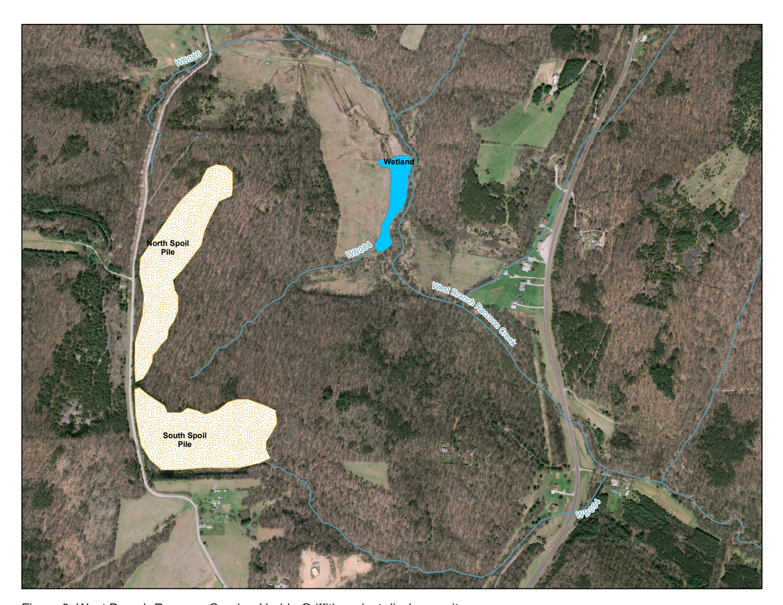
Figure 2: West Branch Raccoon Creek - Harble Griffith project discharge sites

Generated by Non-Point Source Monitoring System www.watersheddata.com