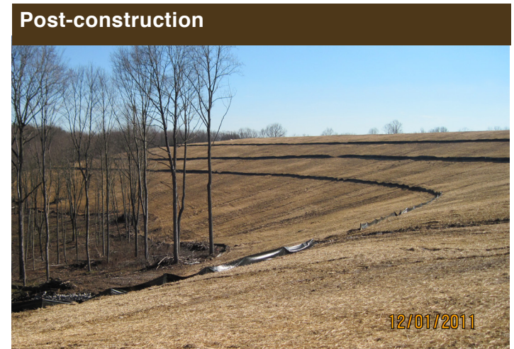
Recontoured and seeded hillside after removal or gob and spoil piles