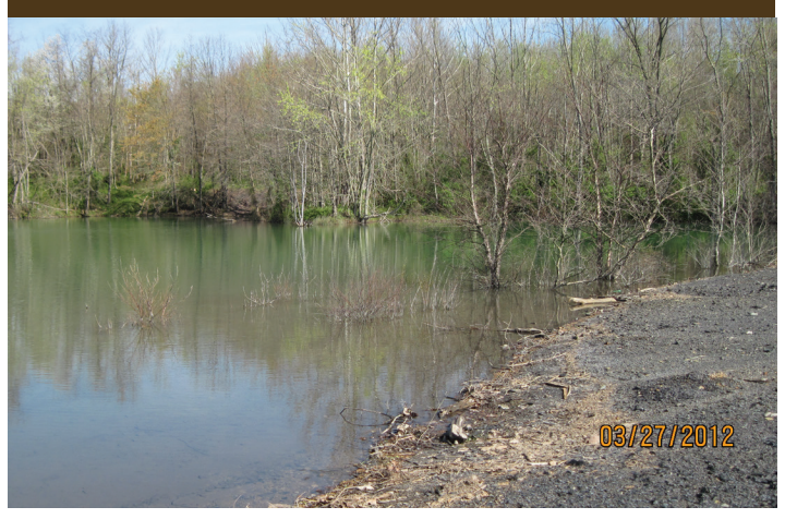
Lake Morrow pre-construction

Lake Morrow is located in Section 16 of Milton Township in Jackson County and lies within the 12 digit HUC unit #050901010403. It discharges into Flint Run a tributary to Little Raccoon Creek. The Flint Run sub watershed is affected by abandoned strip mine drainage and associated unreclaimed coal refuse piles. This area was the coal washing and loading facility for the Broken Aro mine. The site is very complex hydrologically, the site consists of large buried slurry impoundments and surface mining pits around the rim of the main valley. The Lake Morrow AMD Reclamation Project involves reclaiming the strip lake and adjacent spoil piles resulting from underground and surface mining that occurred from 1943-1975. AMD was generated from lake water seeping through the mine spoil embankment and leaching out metals and acid into Flint Run. The treatment of Lake Morrow was designed to drain the lake, create positive drainage and bypass the spoil embankment. Design was completed in-house by ODNR-DMRM. Construction started in July 2013 and was complete in September 2014. Environmental Remediation Contractor (ERC) completed construction, 9-8-2014, at a cost of $667,006. Funding source for the design is ODNR-DMRM and construction is ODNR-DMRM and OSM. Prior to construction, Lake Morrow site, FR0110, showed acid and metal loadings to be 138 lbs/day of acid and 17 lbs/day of metals (Figure 1).