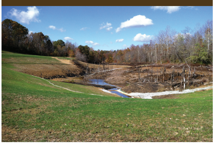
Lake Morrow post construction