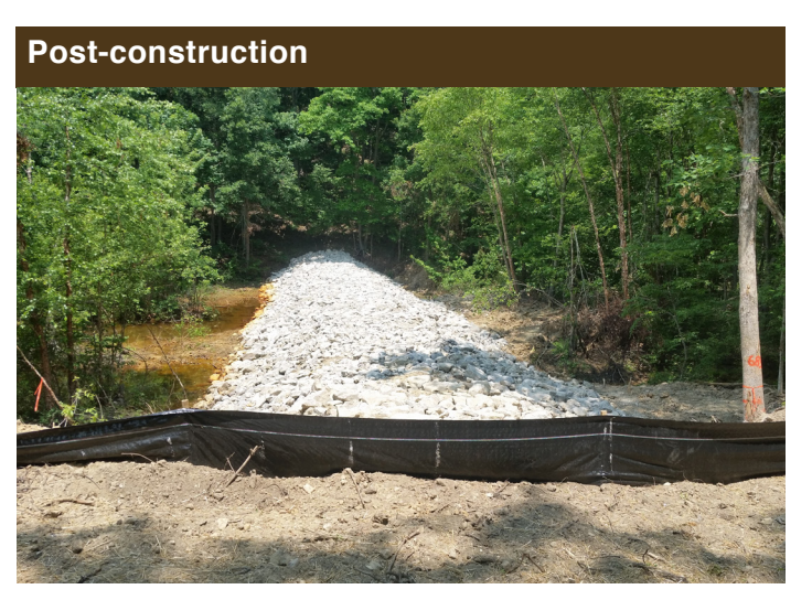
Flint Run Wetland Berm

Flint Run Wetland Enhancement project is located in Section 16 of Milton Township in Jackson County and lies within the 12 digit HUC unit #050901010403. Flint Run Wetland Enhancement project is needed to address abandoned underground and surface coal mining of the Clarion Coal Seam – No. 4a, and the resulting acid mine drainage (AMD) that has negatively impacted the entire Flint Run watershed. Typical water quality entering Little Raccoon Creek from Flint Run is pH 4.0, aluminum concentration of 7 mg/l, and iron concentrations of 13 mg/l. The project location is downstream of multiple AMD treatment projects and the bulk of the abandoned coal mining. The existing wetland was enhanced by the installation of one limestone berm across the Flint Run Valley. The cross berm will allow metals to settle out in the wetland rather than being transported downstream to Little Raccoon Creek. Design completed inhouse at DMRM ($19,874). Construction was completed by King Environmental Construction for $143,054. The funding source for this project was ODNR/DMRM and OSM. Pretreatment acid and metal loadings at Site FR095 are shown in Figure 1.