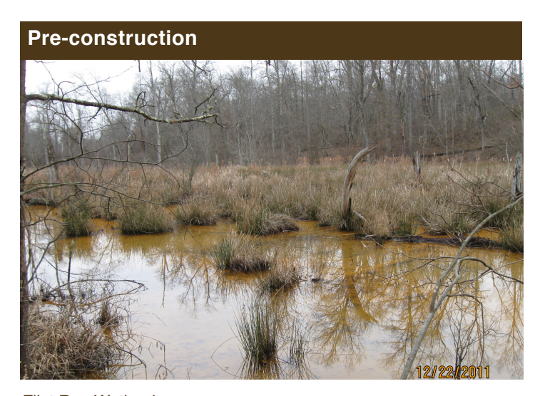
Flint Run Wetland

Project Status: completed 5/29/2015 ODNR Project Number: JK-MI-76