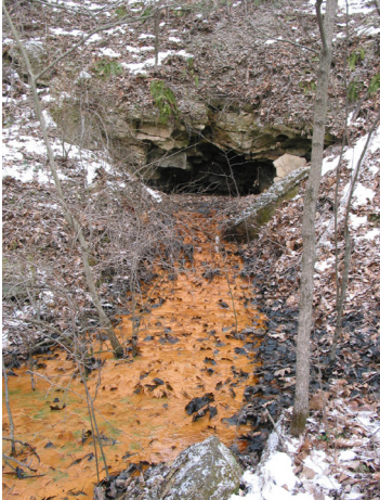
Underground mine entrance, Photo by Brett Laverty