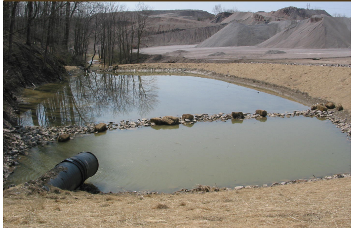
Jymar Steel Slag Leach Bed