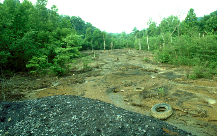
Mine waste in valley