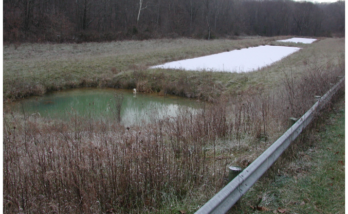
Successive Alkaline Producing System (SAPS), Photo by Ben McCament

Buckeye Furnace and Buffer Run Project is located in Section 25 of Milton Township in Jackson County and lies within the 12-digit HUC unit #050901010403. The site is 65 acres and is located in the Little Raccoon Creek subwatershed. Deep mining of the area resulted in continuous AMD discharge from underground mines to Buffer Run, a tributary to Little Raccoon Creek. This area was also strip mined and used for a wash plant facility for a deep mine operation, resulting in several unreclaimed coal refuse areas and slurry ponds draining to Buffer Run. The design was completed by BBC&M Engineering Inc. for $125,000. The treatment approach for this site was to eliminate strip pits, reclaim the gob pile, and install a Successive Alkaline Producing System (SAPS) a passive treatment system. The major considerations for this project was mostly source control and but also constructing a passive treatment system. The goal of the design was to reduce 75 percent of the acidity discharging into Little Raccoon Creek. Construction was complete June 20, 1998, by Earth Tech Inc. for a cost of $1,090,530. The funding source for the project design was ODNR-DMRM, and for construction the sources were ODNR-DMRM, OEPA and OSM. Pre-treatment acid and metal loadings at site BR0010 are shown in figure 1.