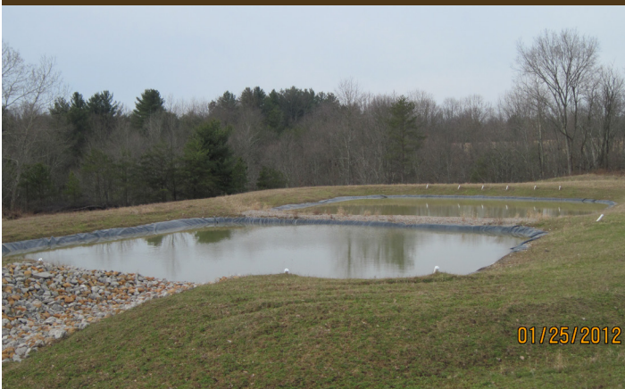
EB III Winifred SLB