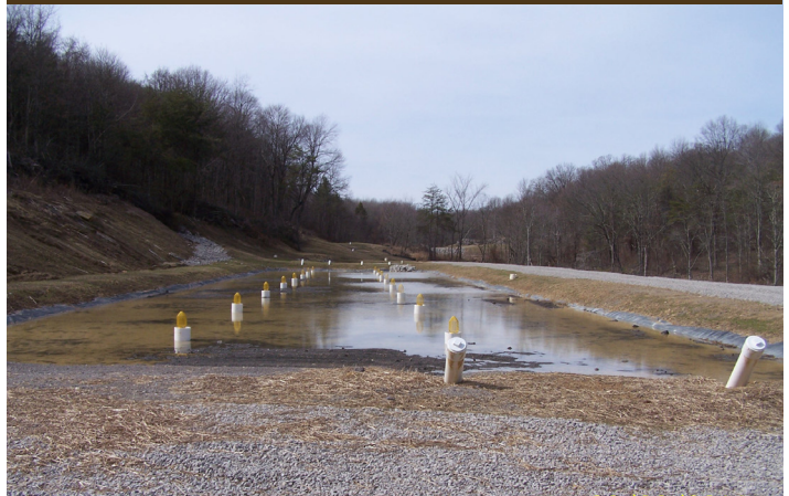
Steel slag bed at Kern Hollow