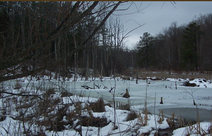
Kern Hollow SLB site